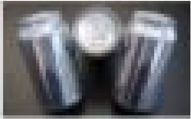
Figure 1.1.1. Sheet metal forming processes. © 2011